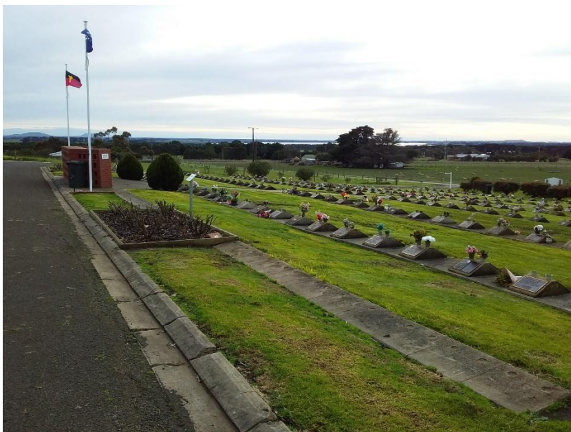
Looking North over Lawn 2 with the Kempton family Rose Garden, Niche wall 2 and the 2 flags at the rear of lawn2.

With the completion of Lawn 3 the Camperdown Cemetery will have 5,714 sites of which 4,384 are used and 453 sites are reserved.