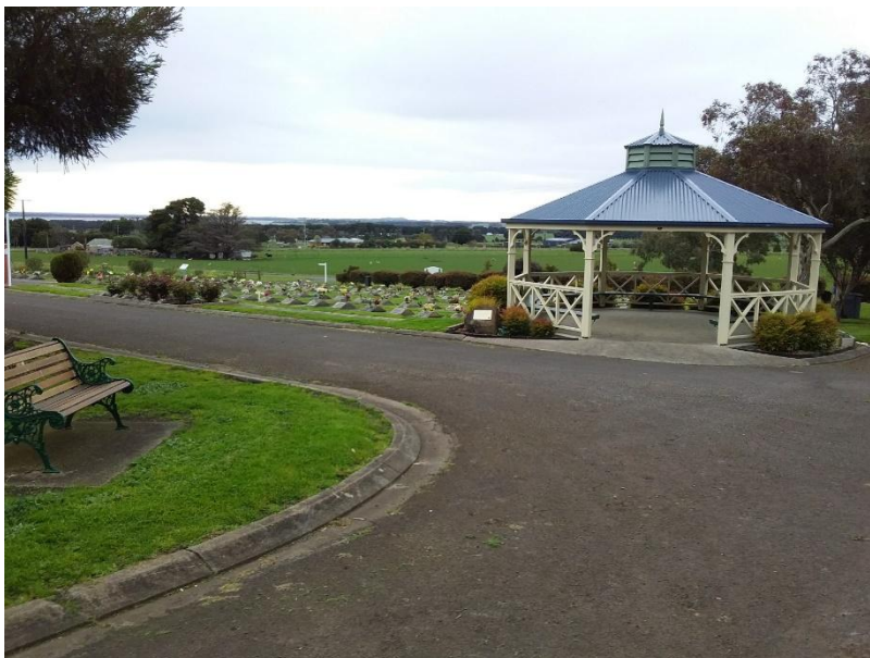
Looking North over Lawn 2 with the Gazebo in the foreground.

The Camperdown Cemetery currently has 5,715 sites of which 4,409 are used and 468 sites are reserved.