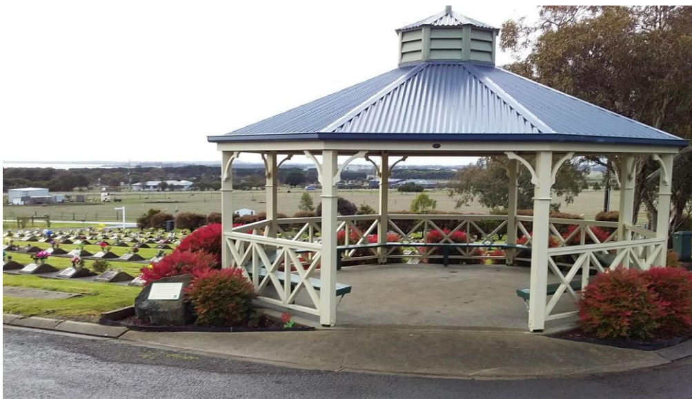
Looking North over Lawn 2 with the Gazebo in the foreground.

The Camperdown Cemetery currently has 5,713 sites of which 4,424 are used and 476 sites are reserved.