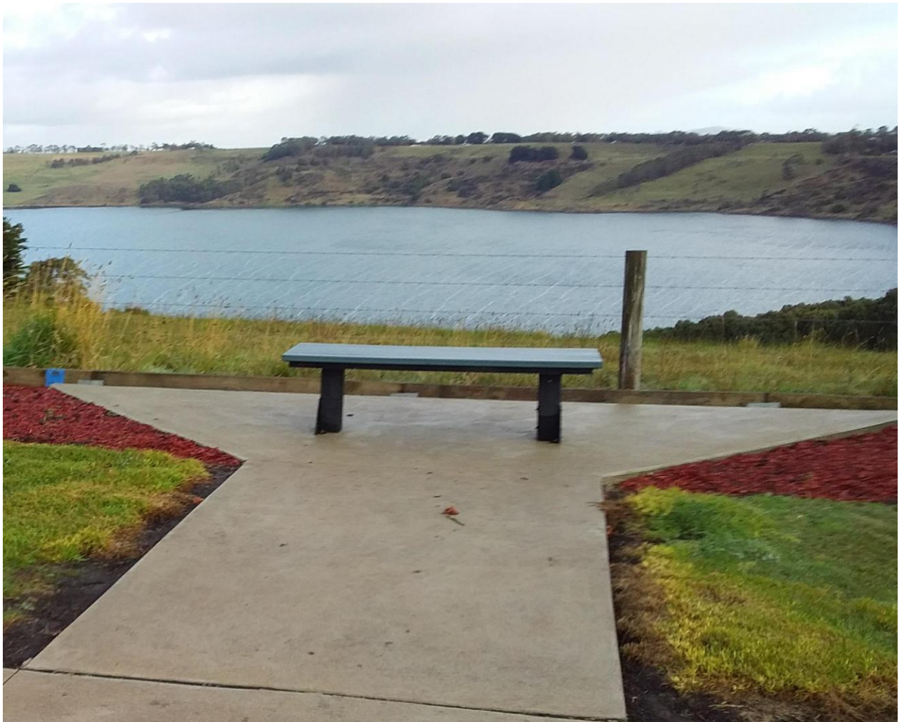
Looking over Lake Gnotuk at the rear of Lawn 3.